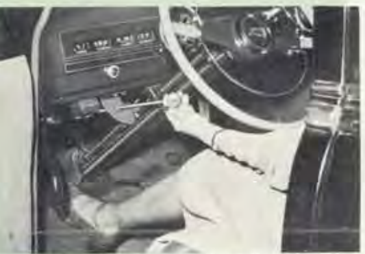
Just depress the clutch and pull out the conveniently located overdrive control knob at the left of the steering column. When it clicks, or latches, you're in the Overdrive Range.

The ratio of engine revolutions to rear wheel revolutions determines how much power — and economy — you get. In low gear, for instance, your Chevrolet engine "turns over" fairly fast — delivers maximum power for fast acceleration and starting up steep grades. When you shift from first to second, your engine slows down almost a third — but you still have adequate power for continued acceleration and for climbing steep hills. In high gear, your engine slows down even more. But it's still delivering plenty of power to the rear wheels — in fact, more than you need for most normal driving. With a Truckstell Tip-Toe-Matic Overdrive in your Chevrolet, you add a 4th gear . . . a smooth new Cruising Gear that's really easy on the gas! Your engine runs 28% slower than in 3rd gear, but your road speed remains the same! And in Overdrive 2nd, you have a power gear that's ideal for hills and extra fast pick-up.