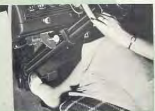
For full power performance, all you need do is depress the clutch momentarily or push the accelerator to the floor and, quick as a flash, you're back in conventional.