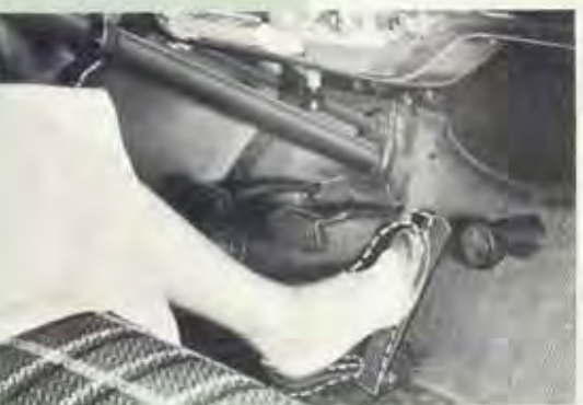
Then, after getting under way, all you need to do is release the accelerator momentarily and, instantly, smoothly, you're in overdrive.